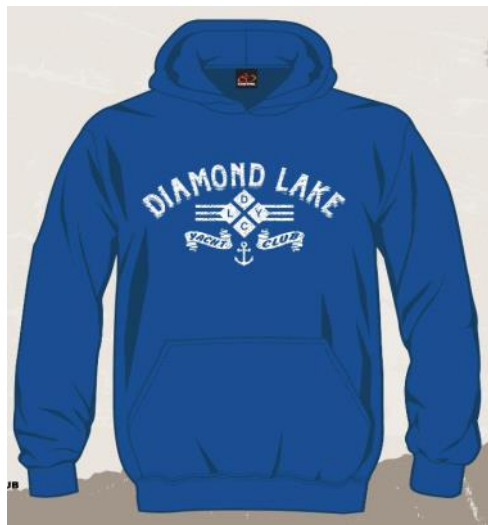
Unisex Hooded Sweatshirt Youth & Adult