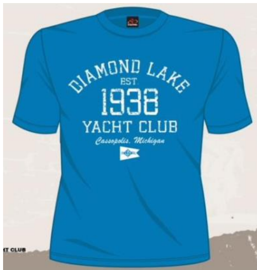
Unisex T-Shirt Youth & Adult